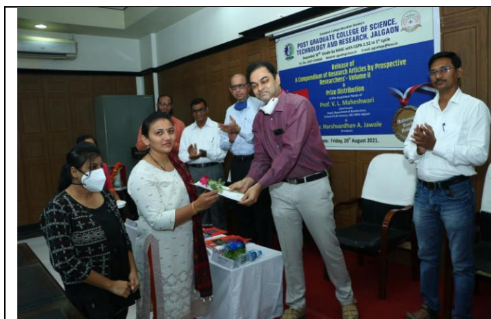
Prize Distribution Function

A compendium of research articles by Prospective researchers' for the academic year 2019-20 with ISBN number 978-81-949083-3-3 is ready for its publication. In the current academic year 2020-21, 19 numbers of students completed 19 research projects/articles under the supervision of 9 number of expert teacher. The list of the projects undertaken by the students under the guidance of supervisors is given in the table below.