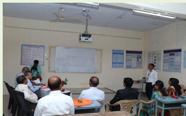
Department of Chemistry