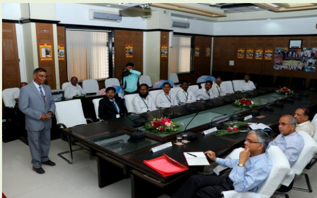
Presentation by Principal