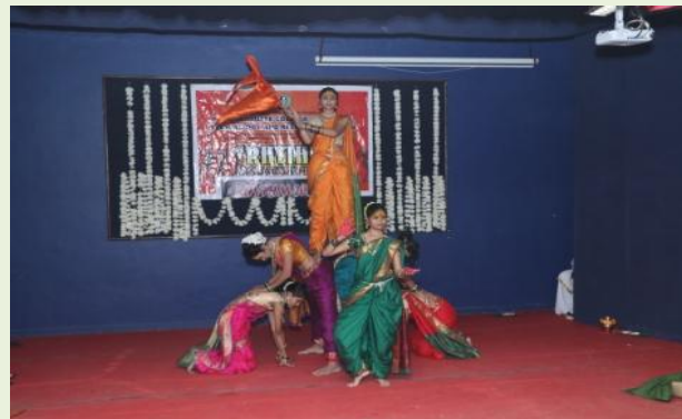
Gathering RHYTHEM Cultural Event