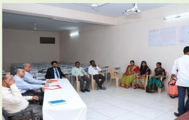
Department of Mathematics