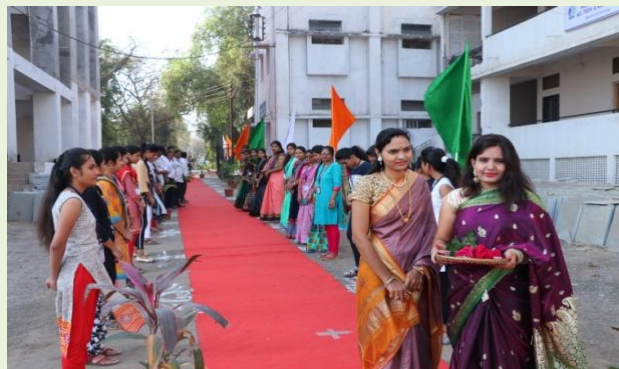
Welcome to peer team members of NAAC