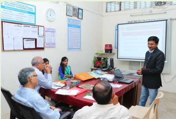
Department of Microbiology