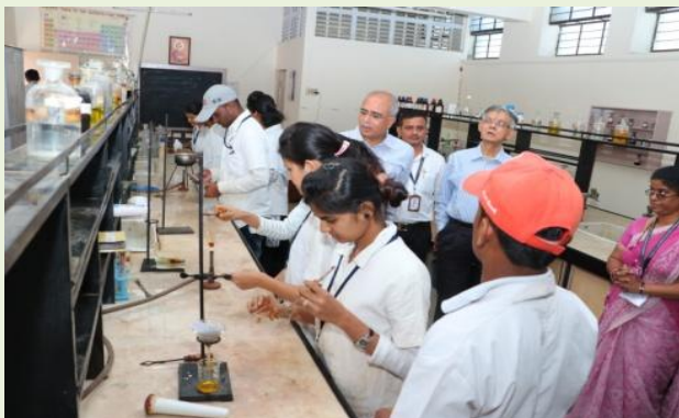
Organic Chemistry Laboratory