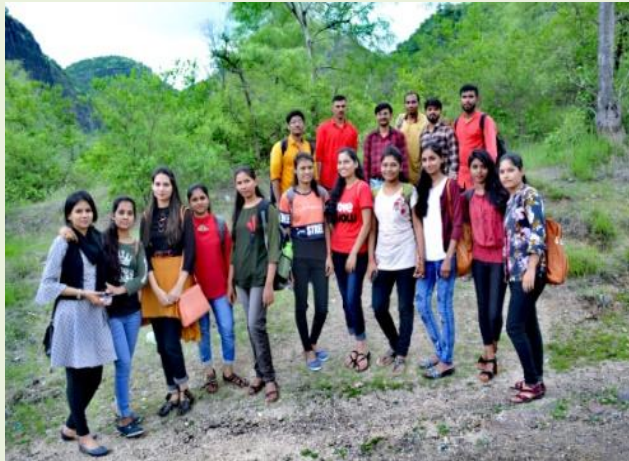
Industrial Visit Microbiology Department