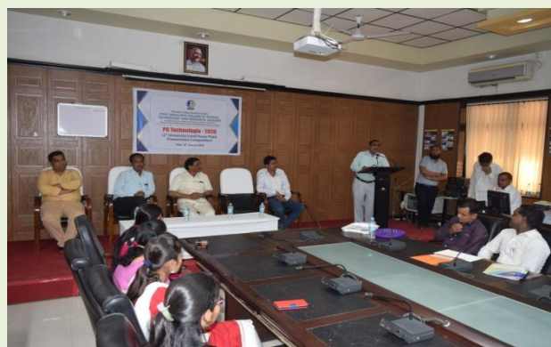
Prize Distribution of PG TECHNOLOGY