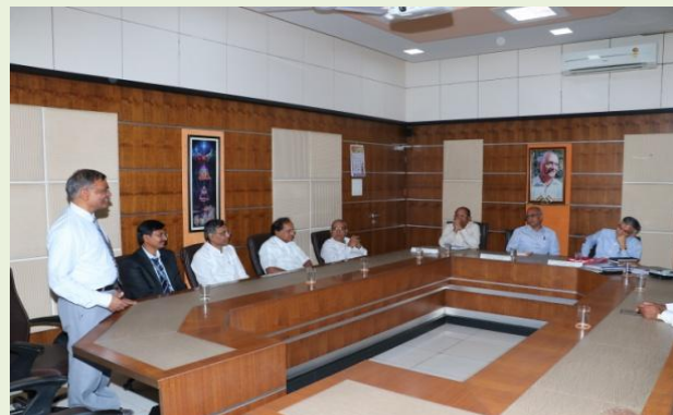
Lunch on Meeting with NAAC peer team