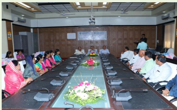
Parents Alumni Interaction With NAAC PEER Team