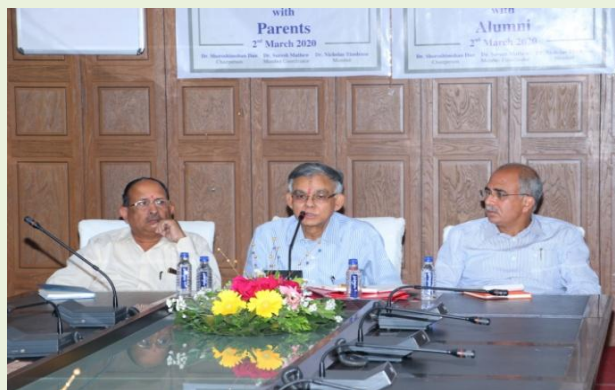
Parents Alumni Interaction