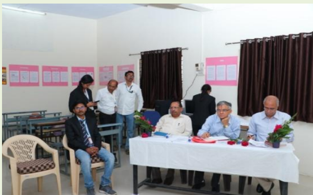
Department of Chemistry