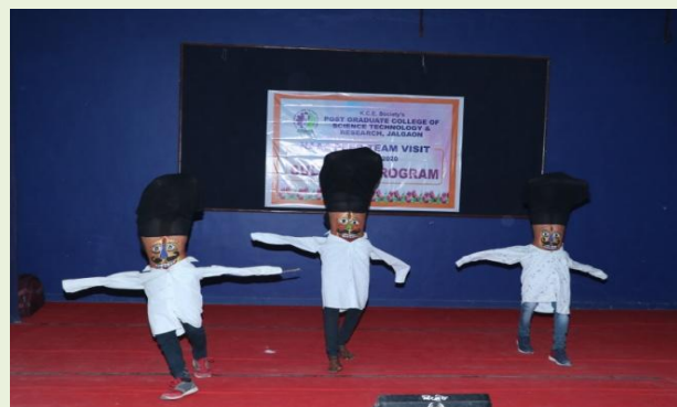
NAAC Cultural Event