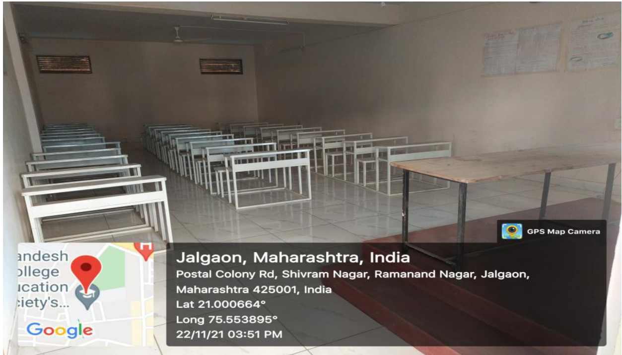
Class Room: 11