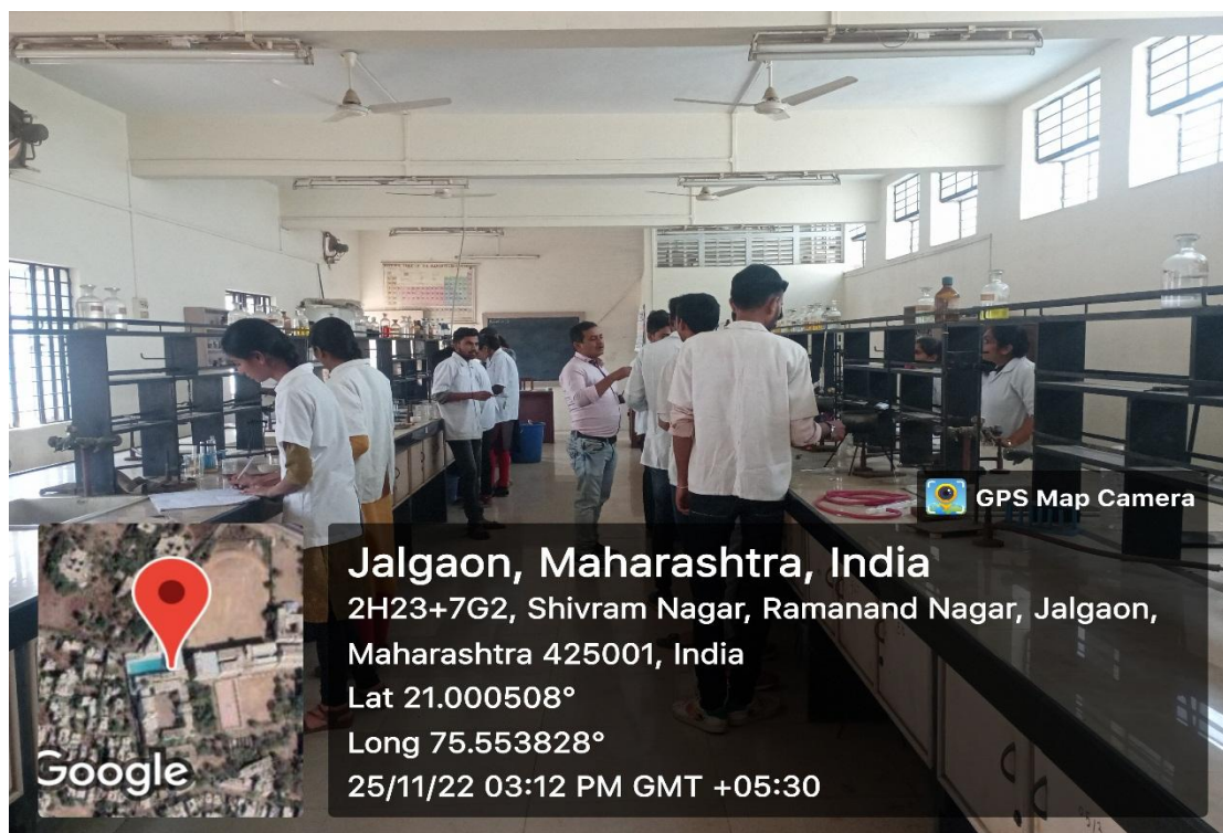
Organic Chemistry Laboratory