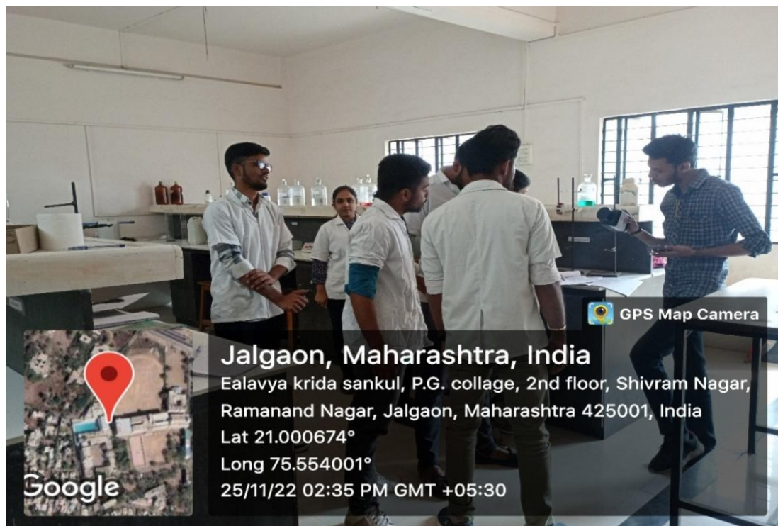
Physical chemistry Laboratory