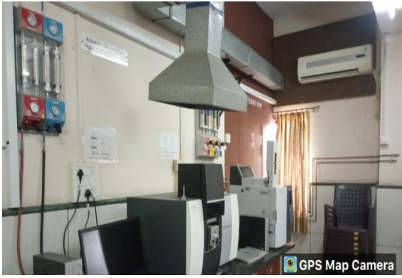
Central Instrumentation Laboratory