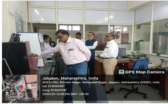
Central Instrumentation Laboratory